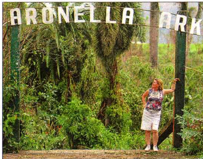
Sign of the times . . . the damage on the gates